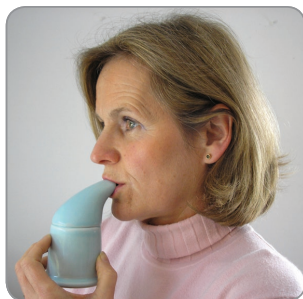
Inhale through your mouth

In addition, saline solution may improve ciliary function. Cilia are the hair-like structures that line the lungs, throat and nose (respiratory tract). They must work together to move allergens, pathogens, excess mucus and fluid out. The need for uniform ciliary function is well illustrated by a smoker attempting to quit. There is a period of time, when the cilia are not working together, when a cough develops. This is one of many issues that makes quitting difficult. Saline irrigating is also one of the only options to address the hard to reach sinus areas and whole ciliary matrix.