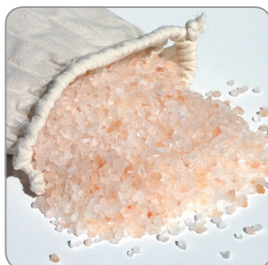
Coarse Granulated HCS