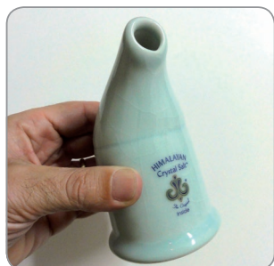
Porcelain Salt Inhaler

Another condition which is believed to benefit from dry salt inhalation is cystic fibrosis - a very complex disease of the lungs and bronchial tract. In the lungs, the layer of salt and water that our body creates to coat airways is only about a millionth of an inch thick. When it becomes irritated, mucus thickens excessively and can be difficult to clear. It appears then that while the normal defenses of the body help to trap and segregate invaders, too much of a good thing can be a problem. Everyone who has ever had a sinus infection has experienced this. Cystic fibrosis patients have been found to have lower naturally-occurring salt concentrations in their bronchial tissue. Researchers have also identified a genetic predisposition in these patients that means the mucus is not thinned appropriately. Therefore salt inhalation, which reaches the bronchus, has symptomatic benefit for cystic fibrosis patients due to mucus thinning. Similarly ex-smokers report a lot of phlegm (mucus) in their throat for 12-18 months following quitting. Dry salt inhalation supports this process by breaking down the excess phlegm and helping expectoration (e.g. coughing and spitting).